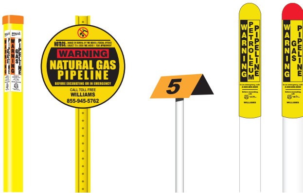
Permanent pipeline marker examples

Pipeline rights-of-way must be kept free from structures and other obstructions to provide access for maintenance and in the event of an emergency.